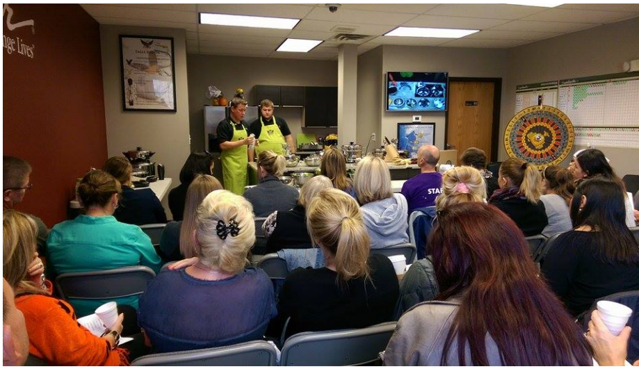
Food enthusiasts gather for nutrition education, food and fun at Healthy & Living, an Authorized Saladmaster Dealership